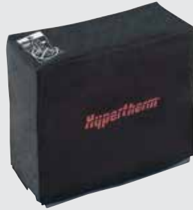
System dust cover