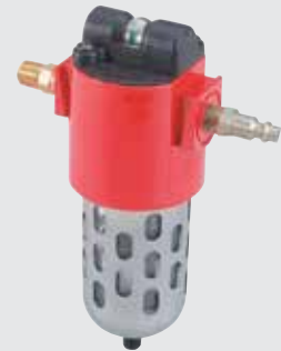
Air filtration kit