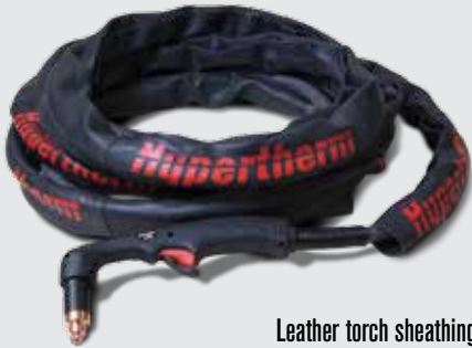
Leather torch sheathing