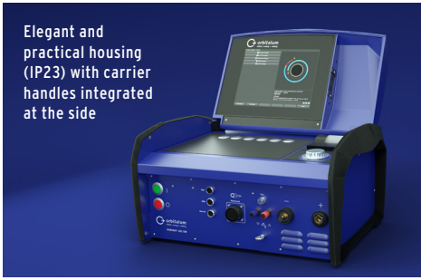
Elegant and practical housing (IP23) with carrier handles integrated at the side