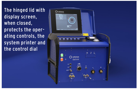
The hinged lid with display screen, when closed, protects the operating controls, the system printer and the control dial