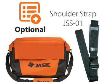
Site Bag JSB-01