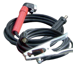
MMA Leads WCS25-3