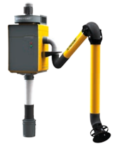
Option: Dustbin extension set

* Ask your sales representative for the complete list of configurations.