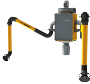
WallPro Double-DM with direct mounted extraction arms