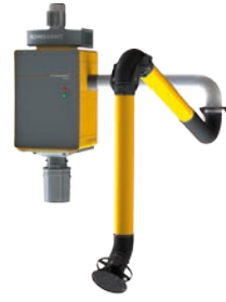
WallPro Single-EM with external mounted extraction arm