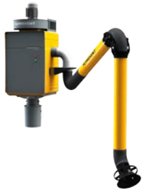
WallPro Single-DM with direct mounted extraction arm